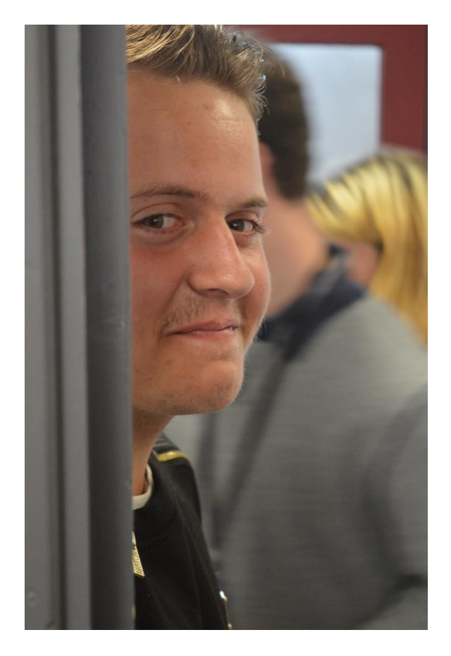
Information for Parents & Carers

The complete School & College Improvement Plan can be found on our website <a href="https://www.thriftwoodschool.com">www.thriftwoodschool.com</a>